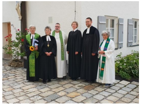
Clergy gathering after the service