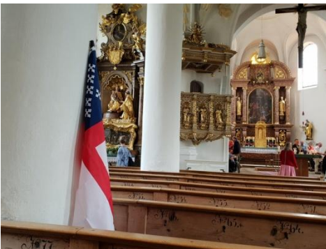
The Anglicans/Episcopalians have returned!