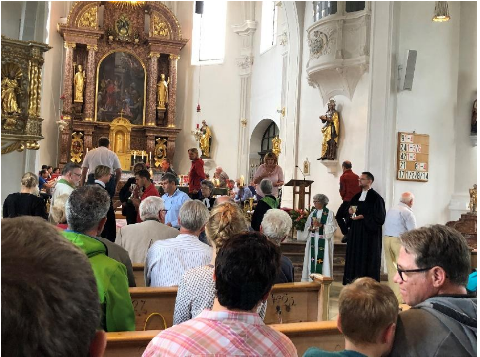
A joyful ecumenical service